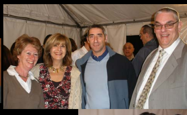
Soup & Schwarma in the Sukkah 150 people enjoyed soup and schwarma in the Sukkah on Monday October 1.